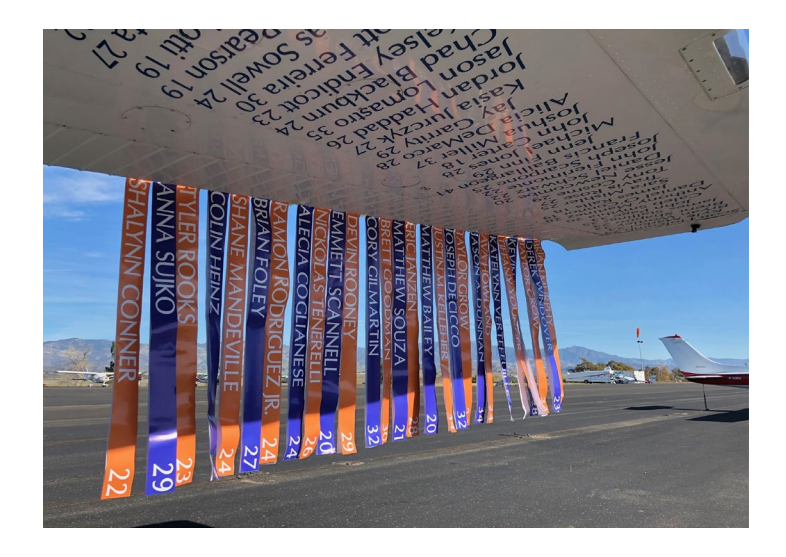
This year, SafeLaunch launched the National Prevention Association. Members of the association consist of concerned parents, nonprofit organizations, and forward-looking businesses who want to be part of the solution